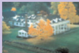
Hill-Stead Museum, Framington.

From bucolic farms, art studios and former artists' boarding houses to grand and modern art museums in vibrant downtowns, European masterpieces to American Impressionism, and ancient art to contemporary culture, the Connecticut Art Trail showcases diverse, quality collections rich in history and heritage.