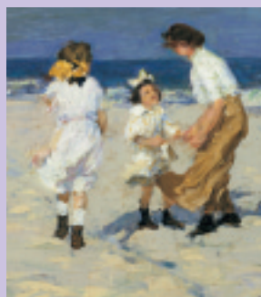
Edward Potthast, Ocean Breezes , c. 1910. Lyman Allyn Art Museum.

While exploring Connecticut's finest treasures, dine at one of our superb restaurants, relax overnight at a charming inn, comfortable hotel or luxurious spa, enjoy performing arts or live theater, shop for distinctive gifts or antiques, or just relax while winding along one of our many scenic roads.